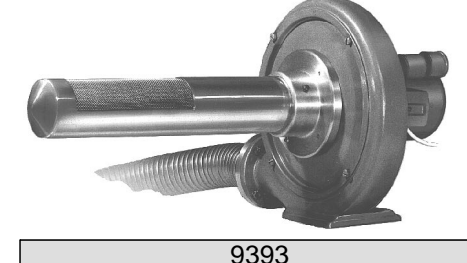
Table 1 Dark files = equipment